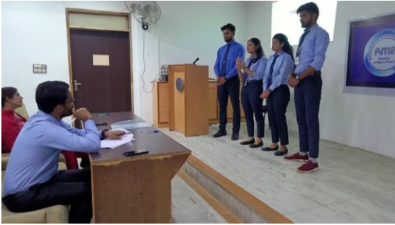
Human Quality Development

PRESTIGE INSTITUTE OF MANAGEMENT & RESEARCH, GWALIOR AN AUTONOMOUS INSTITUTE ACCREDITED WITH UGC NAAC GRADE 'A' AND NBA (AICTE)